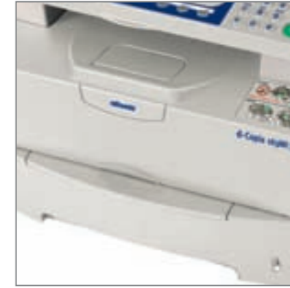
250-sheet PAPER TRAY and single-sheet BY-PASS