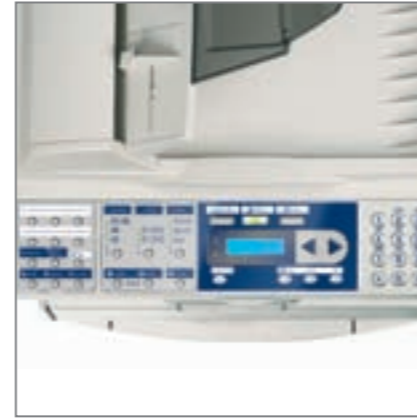
OPERATOR PANEL with copy, scan and fax function keys (fax on the d-Copia 164MF only)