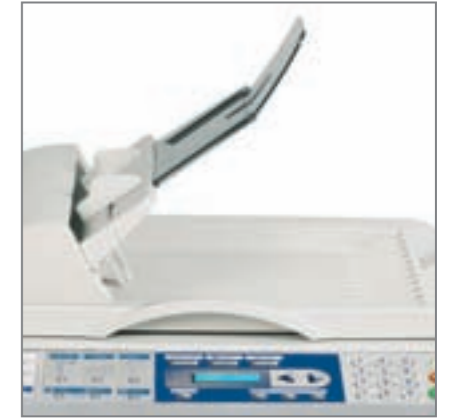
Standard 50-sheet DOCUMENT FEED