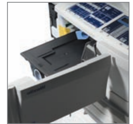
Long-life TONER CARTRIDGE (up to 15,000 A4 pages with 6% coverage)

Efficiency, reliability and cost-effectiveness are the distinctive features of these copiers. The Olivetti d-Copia 1600 and d-Copia 2000 digital copying systems use long-life accessories such as a 150,000-volume drum and 15,000-volume toner to minimise print cost per page and extend maintenance cycles , for lower cost of ownership.