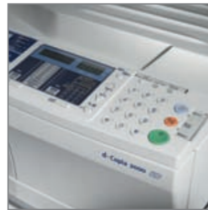
Easy-to-use OPERATOR PANEL for quick access to all digital functions