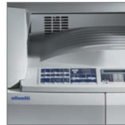
OUTPUT CAPACITY of up to 250 sheets face down